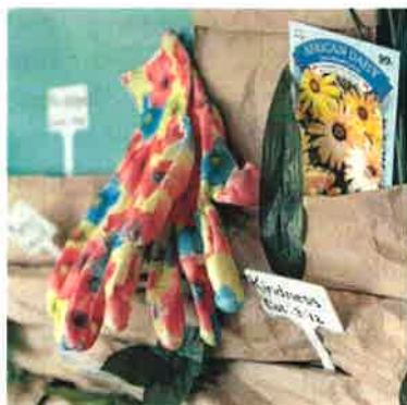
Several of the ladies have been getting together to create welcoming and creative collages in the back of the building. We are so thankful for your work in making the building feel so warm and inviting as we enter inside!