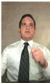
282 ~ No, Not One