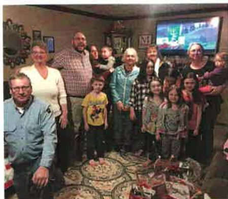
It was a great turnout at the Marshall's to help put together gift baskets for the sick and shut in. The baskets were packed with all sorts of great goodies thanks to the generous donations of so many!