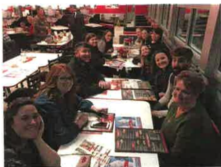
Several members got together to do some last minute holiday shopping and enjoy a meal at Steak and Shake! "Behold, how good and how pleasant it is for brothers to dwell together in unity!" Psalm 133:1