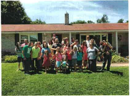
The Shindig was a blast! It is always such a blessing to be reminded our Christian family extends far and wide! It was an encouragement to be together for a great weekend!