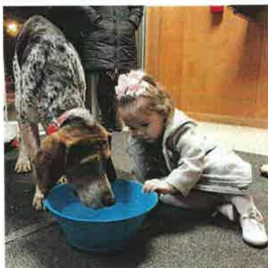
This dog was lost and thankfully found the perfect friend to be cared for and protected by until the owner arrived. "A righteous one has regard for the life of their animal, but even the compassion of the wicked is cruel." Prov. 12:10