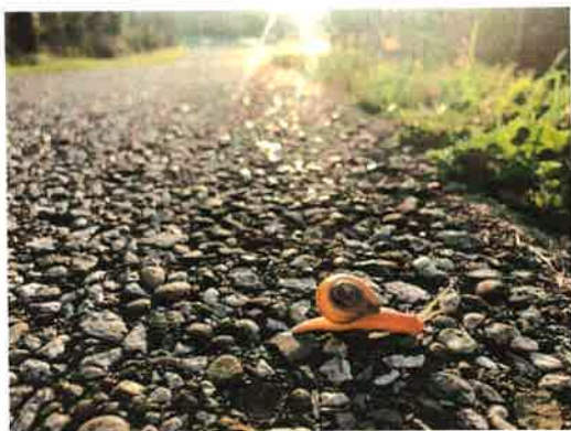
This snail caught crossing the pathway by the building one Sunday morning reminds us to persevere and never give up! "...tribulation brings about perseverance; and perseverance, proven character," Rom. 5:3-4.