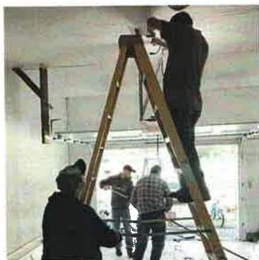
Many hands make light work! There is no shortage of willing volunteers when work around the building and the preacher's house is needed. "Behold, how good and how pleasant it is for brothers to dwell together in unity!" Psalm 133:1